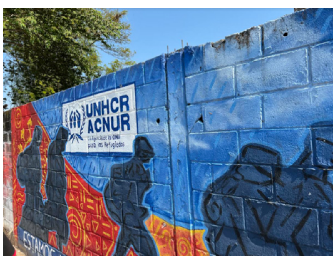
As this mural in Tapachula, Mexico, shows, UN agencies are well aware that their cash aid and assistance helps support illegal immigration over the U.S. southern border. January 2022

Complaints, questions, and proposed legislation about the UN's role in all of this may have gone cold, but as the latest RMRP plan reveals, the world body is as hot on the trail as ever.