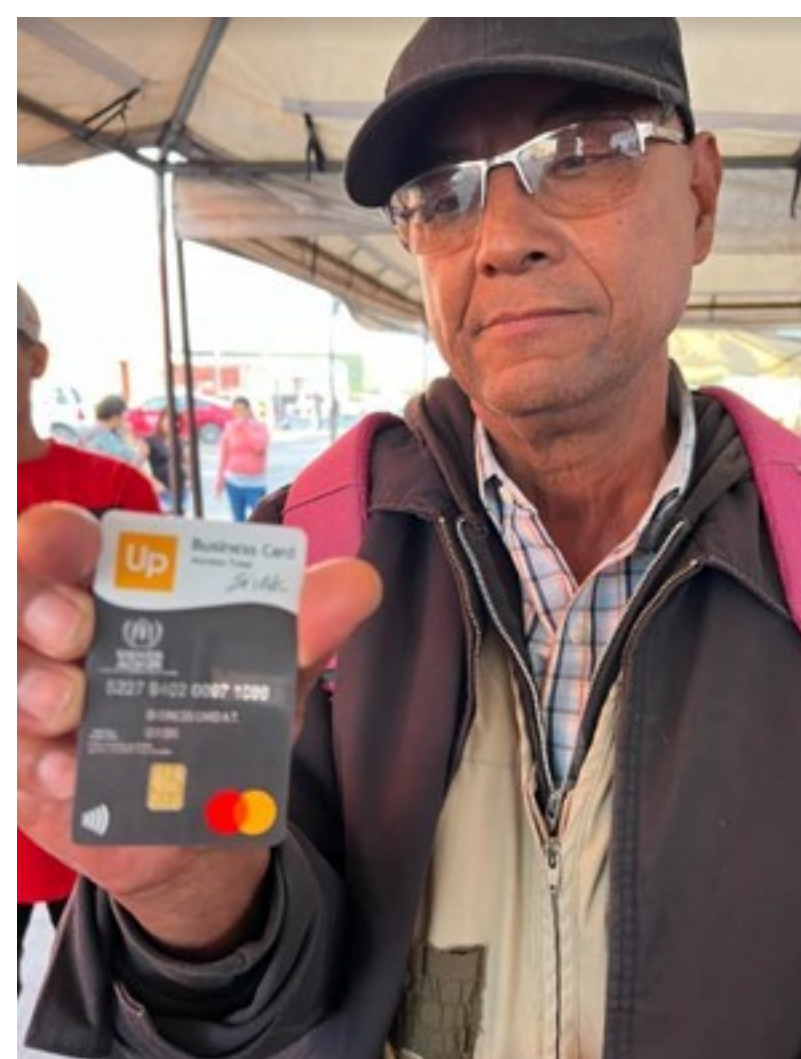
A Nicaraguan on his way to the U.S. showed his UN cash card in Monterrey, Mexico.