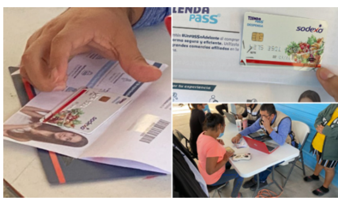
Cash cards going out to immigrants in long lines at a camp in Reynosa, Mexico, in September 2021, photos that first drew ostensibly debunking fact checks.

The $372 million in planned cash giveaways to the 624,000 immigrants moving north and illegally crossing national borders "represents a significantly greater share of the financial requirements" for 2024, the RMRP says, but it is still only one part of much broader UN hemisphere-wide vision that aims to spend $1.59 billion assisting about three million people in 17 countries who emigrated from their home nations. Most will be "in-destination" recipients already supposedly settled in third countries, albeit in declining numbers, but a rising share of cash will go to the spiking numbers of "in-transit" immigrants launching journeys from those accommodating countries north to the United States.