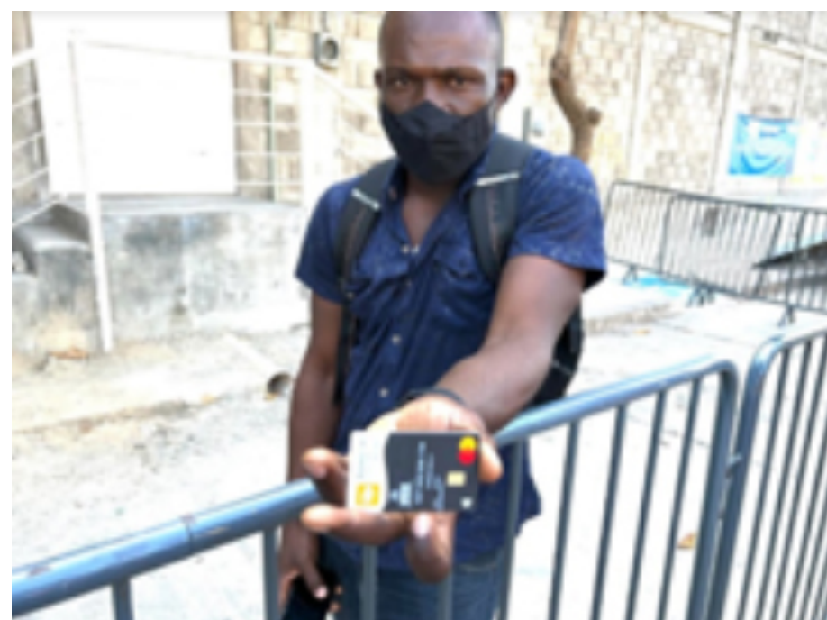
A Haitian shows his UN cash card outside a UN facility in Tapachula. He was there to complain the agency had not deposited money in the depleted card.

But now the UN's 2024 update to the "Regional Refugee and Migrant Response Plan" (RMRP for short), a planning and budget document for handing out nearly $1.6 billion in 17 Latin America countries, can cast a broad confirming light on the cash giveaways and much more aid for 2024 ahead — with the helping hands of 248 named non-governmental organizations. Despite the RMRP plan title naming Venezuelans as recipients of this aid operation, the document's fine print (footnote on p. 14 and paragraph on p. 43, for instance) says the largesse goes to "all nationalities" and "multiple other nationalities".