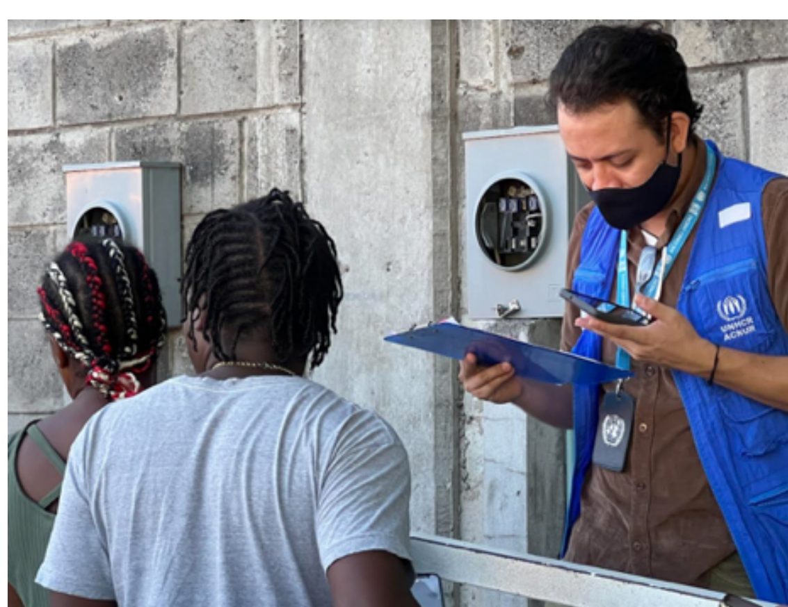
UN workers help long lines of immigrants apply for aid in Tapachula, Mexico.